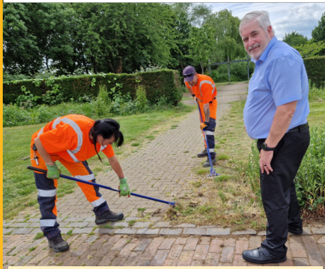
Suez staff clearing weeds from paving