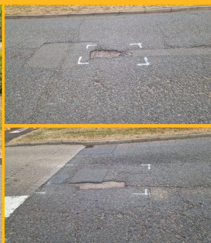
Ben reports a particularly bad set of potholes at Highgate Over between Pimpernel Grove and Birdlip Lane, Walnut Tree. The potholes have now been recently marked for filling.