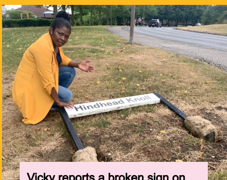
Vicky reports a broken sign on Hindhead Knoll, Walnut Tree.