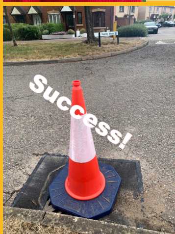
Collapsed drain opposite Hoathy Mews Kents Hill finally repaired by the council.

There have been three reports of motorcycle thefts in our area recently. Report anything suspicious to the police.