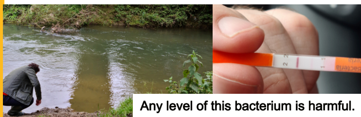
Any level of this bacterium is harmful.