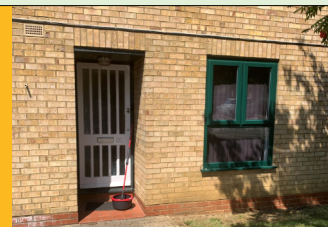
The property in Walnut Tree let out by a scam landlord