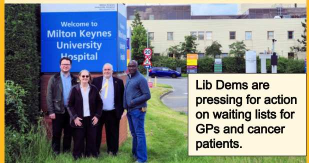
Lib Dems are pressing for action on waiting lists for GPs and cancer patients.

You can read more, and sign our petitions, at www.libbdems.org.uk