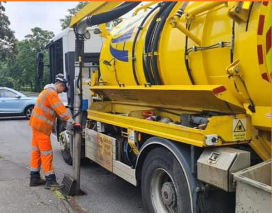
We will ensure critical drains are cleared to prevent surface water flooding.

Residents have the option to cut back a tree that overhangs their property, but the cost is often excessive. We want to set up a programme for apprentices to learn about tree surgery and whilst training offer a service at a cheaper rate for those on low incomes. This will provide an essential service whilst building local talent and local jobs.