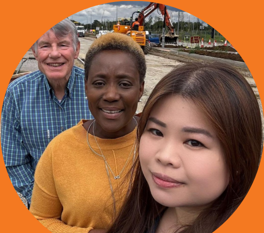
Our teams are working with developers to get things right first time.