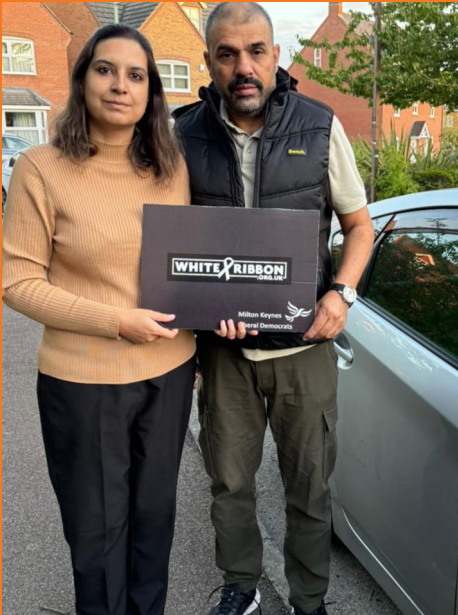
Working to protect the most vulnerable.

It was the Liberal Democrats that established that all taxis' registered in MK must have training about the White Ribbon Campaign . The Taxi community is keen to be involved and want to support a safer city.